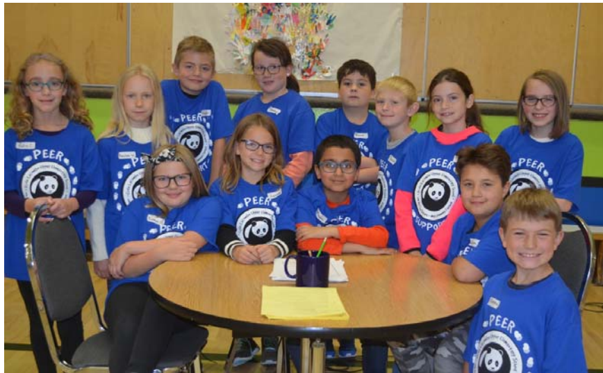
Grade 4 Team

We are proud of their leadership and grateful for their commitment in helping other students talk through conflict situations and assisting in creating positive resolutions. The Peer Support program has been in existence at our school for over twenty years!