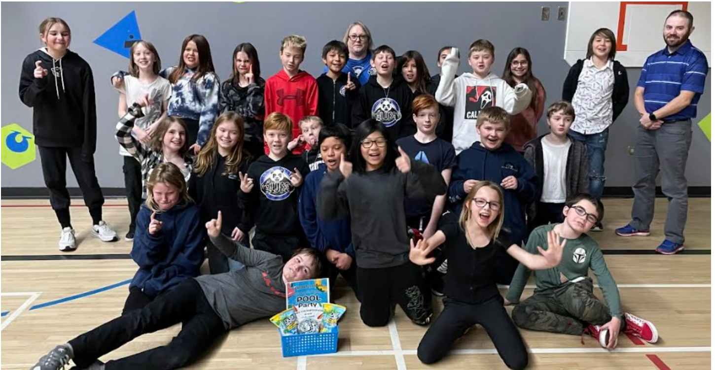
Congratulations to Norris' Nightwing Barbies who were the winners of our December Assembly Challenge! The class wins a Pool Party on the day of their choice at Lacombe Aquatic Center!!